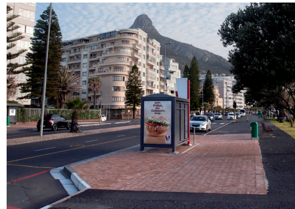
Route 113 expands MyCiTi's coverage in the Sea Point area.